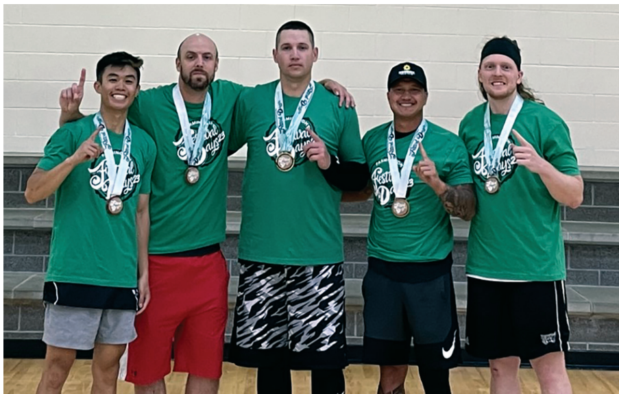
TEAM SHROCK 1st place 3 v 3 Basketball