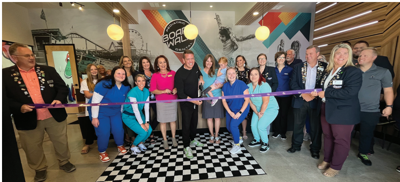
Welcome BOARD WALK DENTAL to Farmington