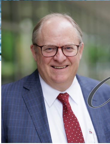
by Scott Isaacson, Farmington City Council