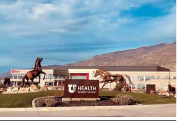
continued page 5

5. Thank you to the U of U Medical Management and Gordon Crabtree for seeing the need to add the beautiful and convenient medical facility at Station Park. This 14-acre development with 133,000 square feet of space has been an important addition to our city and the U of U has been a great neighbor to us. They donated funds for the horses you see in the roundabout at Station Park and money towards the pickleball courts.