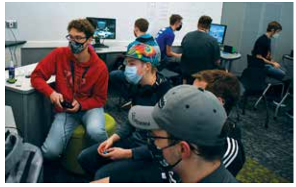
eSports Won 2nd in State

Phoenix raised over $15,000 for a homeless student resource center