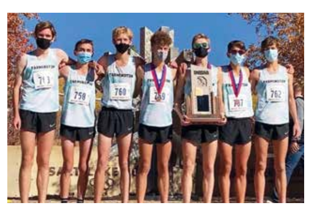
Boys Cross-Country State Champions