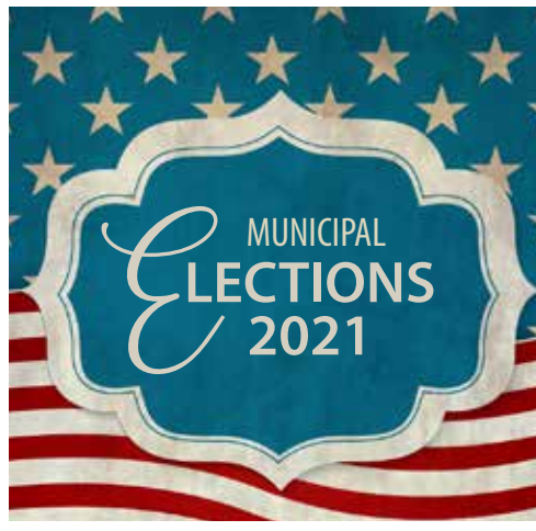
WATCH YOUR MAIL FOR BALLOTS VOTE FOR LOCAL MAYORAL AND COUNCILMEMBER POSITIONS SEE PAGE 3 FOR A LIST OF CANDIDATES

The Utah Championship cares about the health of our community and will follow CDC and PGA TOUR advisories for the tournament.