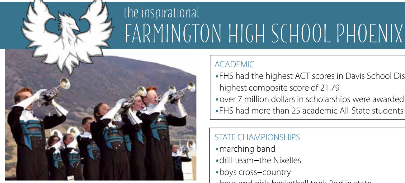
Marching Band State Champions

FHS is a prominent source of pride for Farmington, and accolades are in order. We hope you enjoy learning about accomplishments by FHS individuals and teams who are shining with success and excellence. And they're just getting started . . .