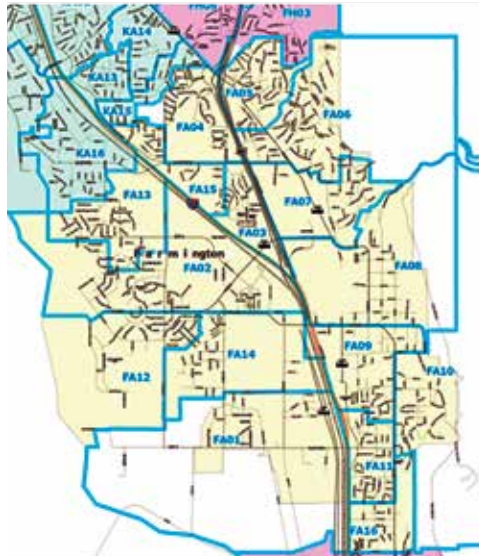
Farmington Voting Precincts