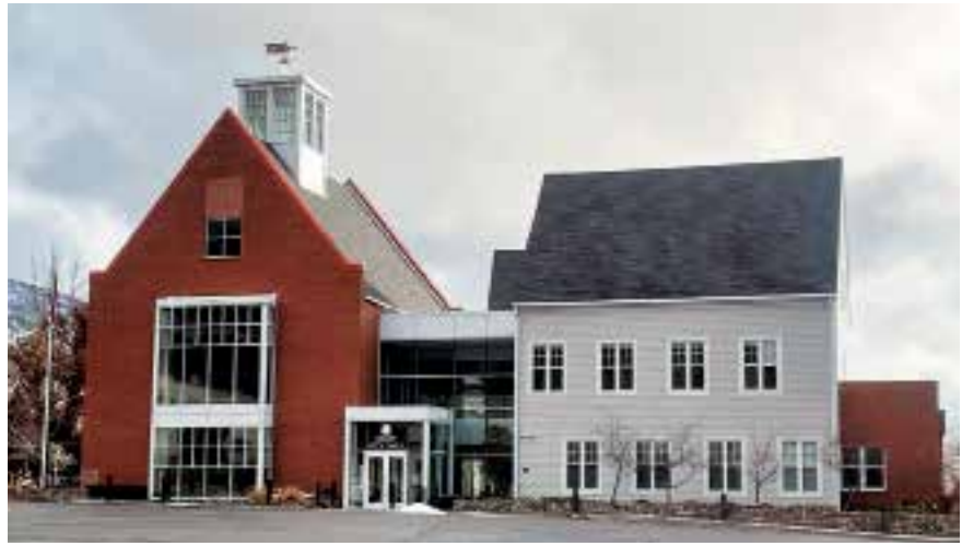
Farmington City Hall