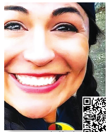
scan the QR code for info on the hiking club

FARMINGTON PARKS & REC INVITES YOU TO JOIN TOUR GUIDE TIA FOR TREASURED TRAILS & WONDER WALKS ALL ADVENTURES LOCATED RIGHT IN, OR NEAR OUR COMMUNITY.