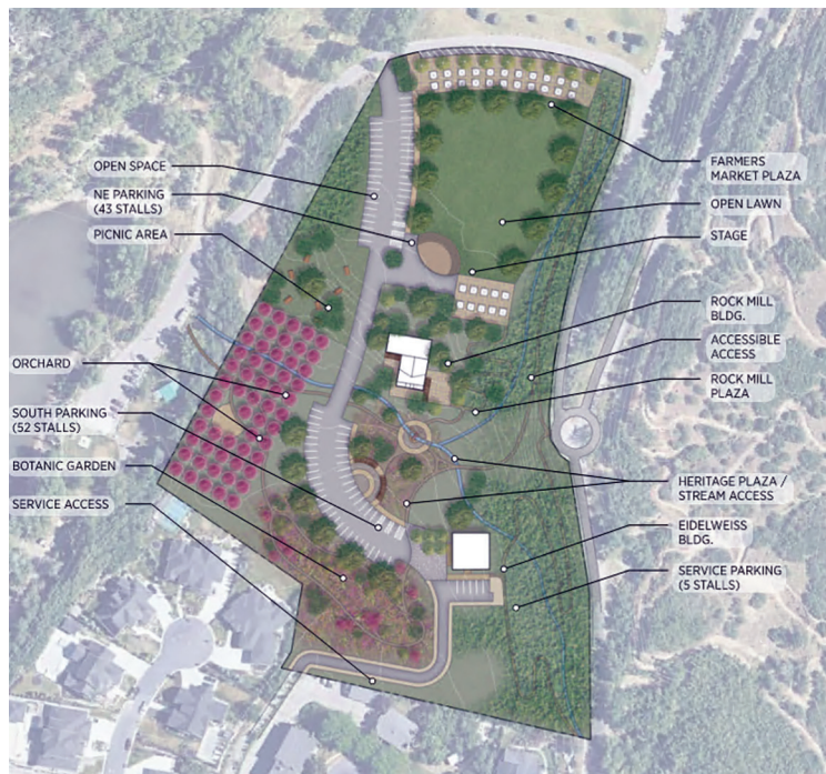
MASTER PLAN FOR FUTURE TOM OWENS PARK SITE

On Monday, October 21st at 12:00 noon, bring your favorite treat to share and come to the Community Arts Center (120 S Main Street) for a fun lunch with the active aging community.