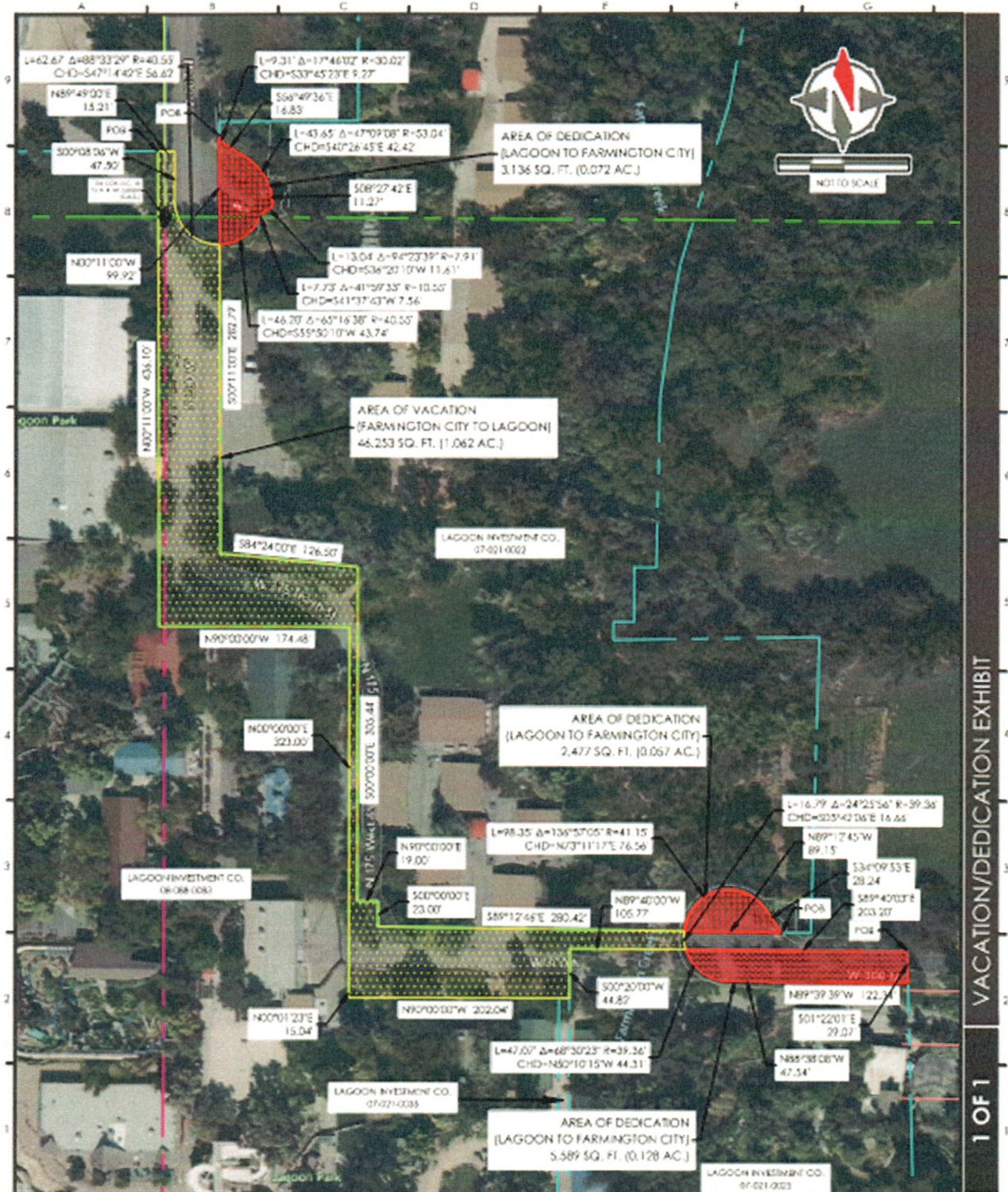
Exhibit of area to be vacated (property outlined in yellow)