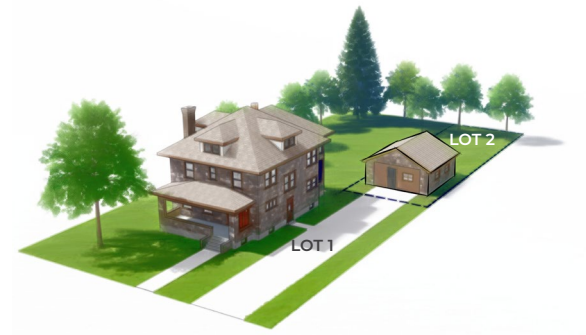
Detached Garage Conversion SSF