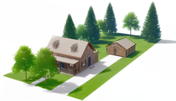
Detached Garage Conversion