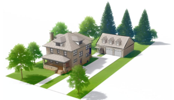
Unit Above Existing Garage