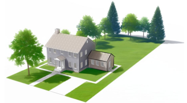
Addition to Main Building