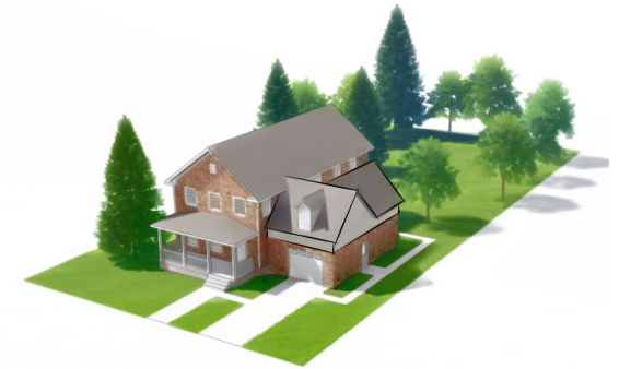
Space Above Garage