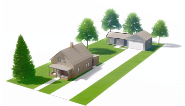
Unit Connected to Existing Garage