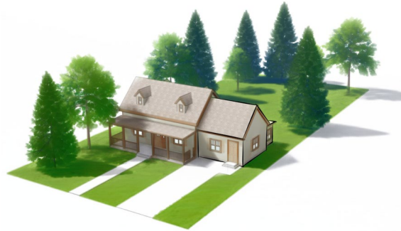
Existing Space Conversion

The creation of an IADU is prohibited if the lot size containing the primary dwelling is less than six thousand (6,000) square feet in size.